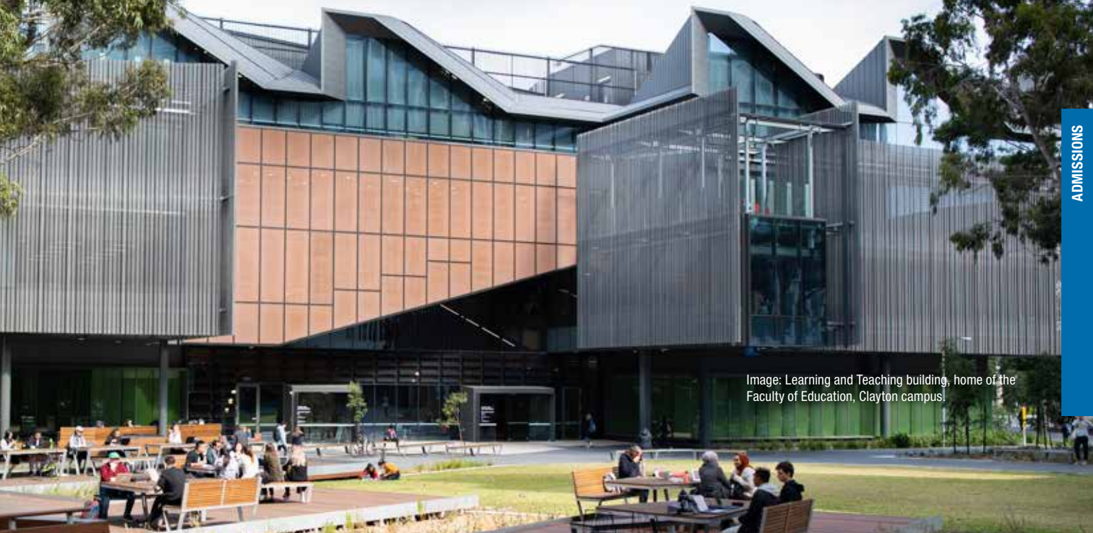
Image: Learning and Teaching building, home of the Faculty of Education, Clayton campus.