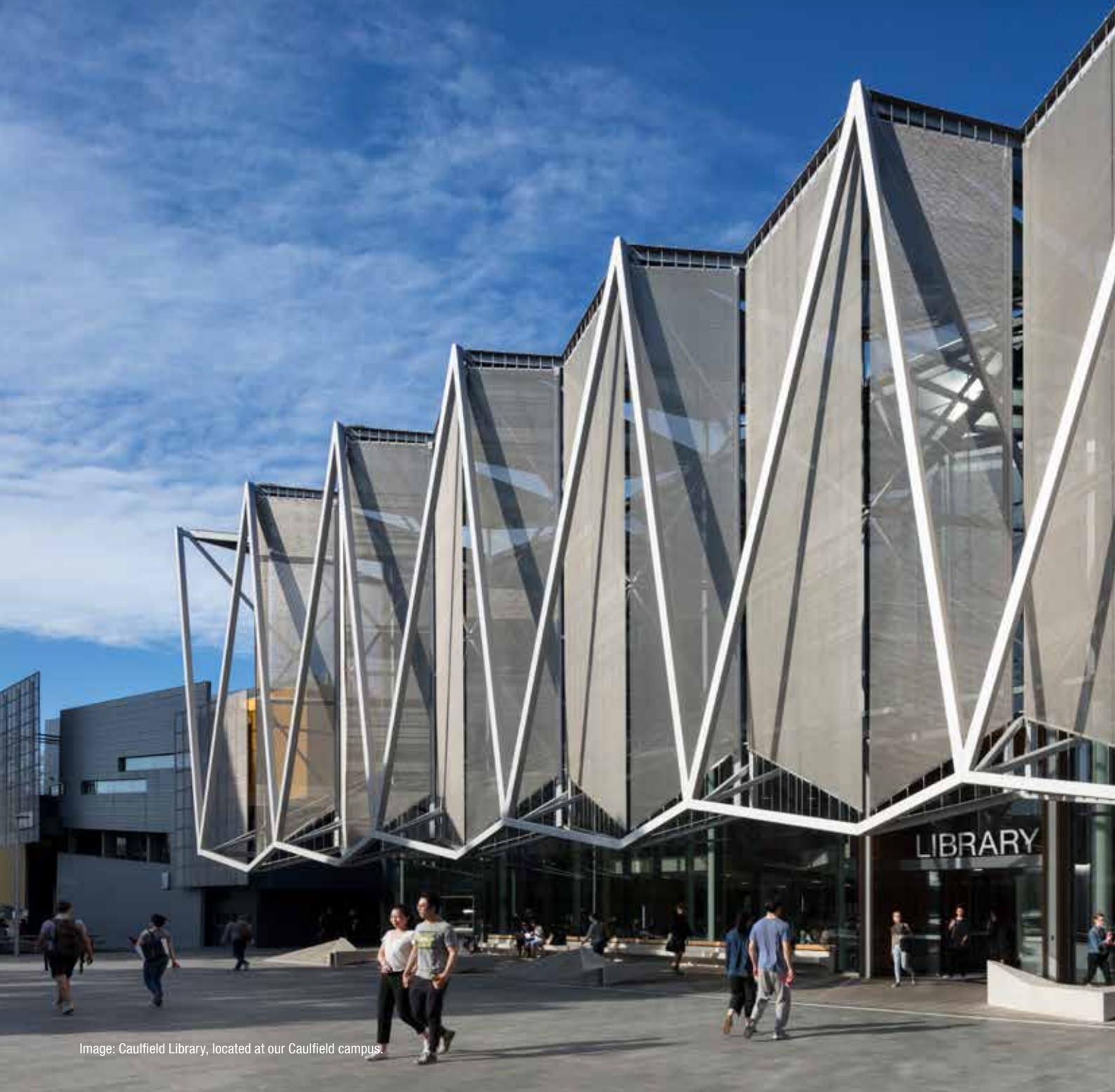
Image: Caulfield Library, located at our Caulfield campus.