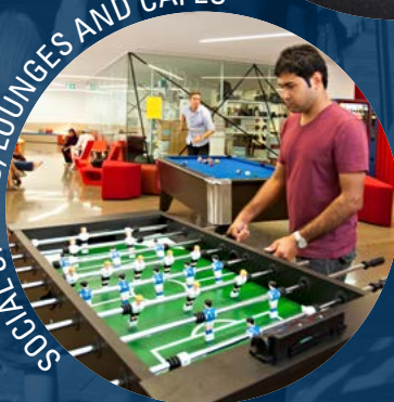
SOCIAL SPACES, LOUNGES AND CAFÉS