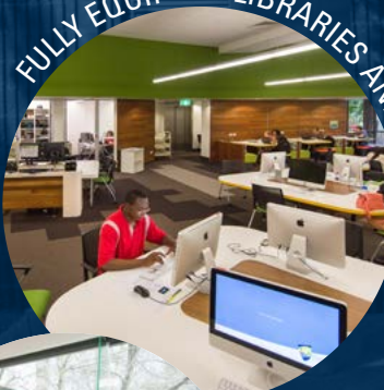
FULLY EQUIPPED LIBRARIES AND STUDY HUBS