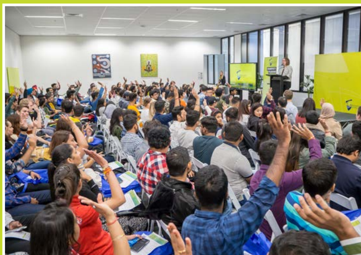
Melbourne campus orientation