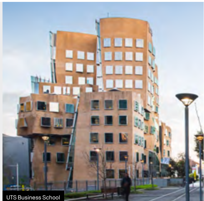
UTS Business School

Haymarket, an historic district next to Sydney's Chinatown, is rapidly transforming into a hub of creativity and entrepreneurship. It's best known for the Frank Gehry-designed UTS Business School where dynamic learning, research and collaboration comes to life.