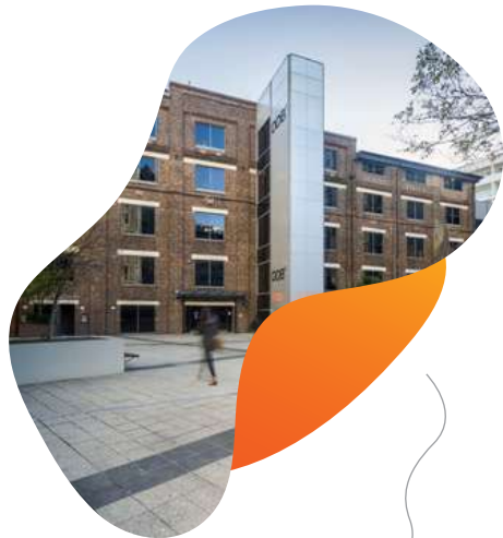
Ultimo Campus 46-52 Mountain St, Sydney

It is home to many international students who are exposed to world-class art galleries, museums, restaurants, shopping, public transport and employment opportunities. Summers are warm to hot and winters are mild. Torrens University Australia has seven campuses in New South Wales.