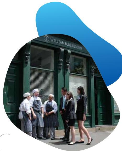
William Blue Dining 107 George St, The Rocks, Sydney

Located in an inner-city precinct, this converted heritage building is the perfect hub for creativity. Study design surrounded by open-plan spaces, high ceilings and plenty of natural light, and take advantage of creative pods for learning, collaboration and entrepreneurship. This space draws its inspiration from cafés and restaurants rather than institutions.