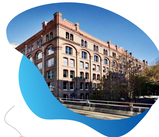
Pyrmont Campus 5/235 Pyrmont St, Pyrmont, Sydney

Home to business and hospitality students, this designer campus is located on Sydney Harbour. It features state-of-the-art learning and teaching spaces offering views of the Sydney Opera House and Harbour Bridge.