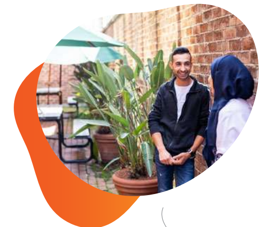
Kent Street Campus L3/333 Kent St, Sydney

This dedicated holistic health and wellbeing campus is located in one of Sydney's fastest-growing and culturally-diverse city neighbourhoods. This campus contains a custom-built health and beauty clinic. Pyrmont is close to Sydney's central business district with easy access to public transport. Students enjoy the latest in learning technology and a creative, social and collaborative learning environment.