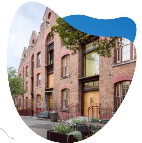
The Rocks Campus 1/5 Hickson Rd, Sydney

This residential campus is designed for Blue Mountains International Hotel Management School (BMIHMS) at Torrens University Australia students, located 1.5 hours from Sydney. Students live and study in a student-run hotel environment for a unique hospitality experience. Experience learning through our outdoor kitchen, custom-designed cocktail bar, housekeeping demonstration lab and hotel check-in desk.