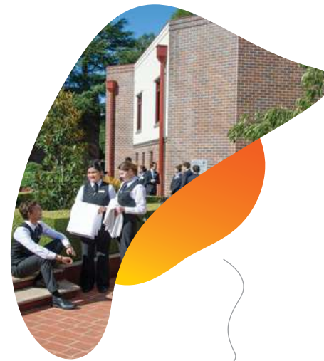
Leura Campus 1 Chambers Rd, Leura, NSW

This is an executive hospitality campus for third-year undergraduate and postgraduate Blue Mountains International Hotel Management School (BMIHMS) at Torrens University Australia students. Enjoy studying in the heart of this great city.