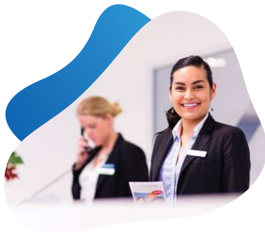
Town Hall Campus L4/540 George St, Sydney

William Blue Dining is Torrens University Australia's award-winning student training restaurant which is open to the public. Our hospitality students will undertake practical training at William Blue Dining, learning first-hand what it takes to run a busy restaurant and hospitality business, whether they dream of mastering the kitchen or front of house.