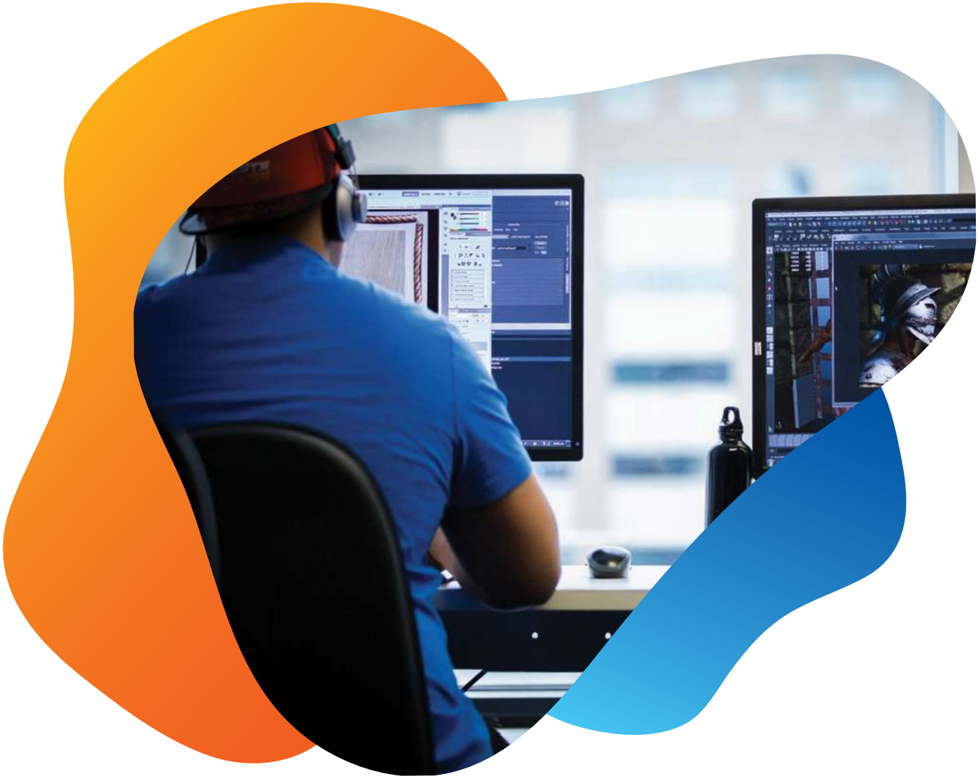
Game Art students at work